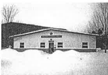
(NWSWD Georgia headquarters)

Northwest Vermont Solid Waste Management District (NWSWD) is a legislatively chartered Municipal Corporation (similar to a school or water district) charged with planning, implementing, and regulating waste management strategies for our member communities. Our drop-off sites in Georgia, North Hero, St. Albans City, Montgomery, and Bakersfield provide close-to-home waste disposal and recycling options. We also aid schools, businesses, residents, and events in forming waste reduction and disposal strategies. Do you have a question about waste reduction, recycling, composting, or disposal? Get in touch with us; our help is free and we're happy to assist you!